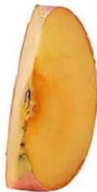
Severely oxidized when placed in air