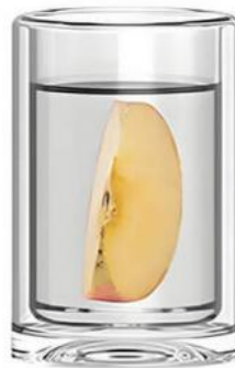
Oxidation is obvious w hen placed in normal water