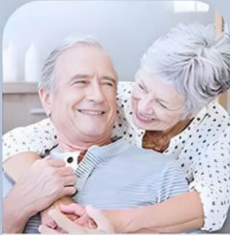
Middle-aged & elderly people

Pregnant women/elderly/children/hypertensive diabetes can drink