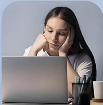
Work overtime & stay up late