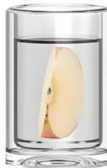
The oxidation is not obvious when placed in hydrogen water