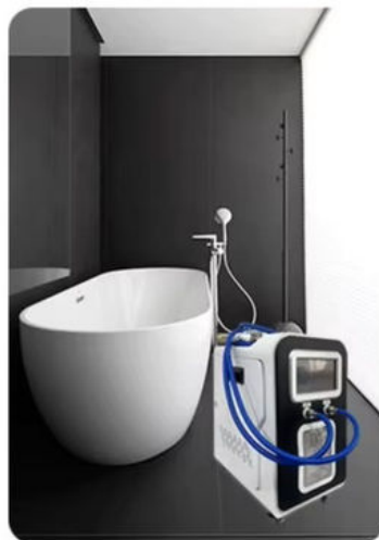
Can be pumped for use

It can be directly connected to a water heater or recycled for hydrogen production