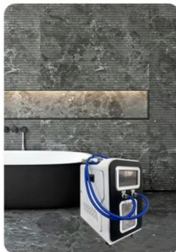
Can be connected to a water heater