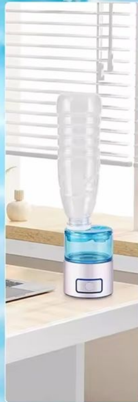
Water Bottle Connection

Benefits of the SPE Hydrogen - Generating Bottle: