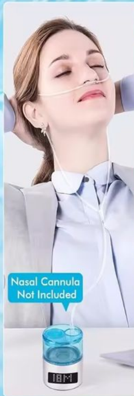
18M Hydrogen Inhalation