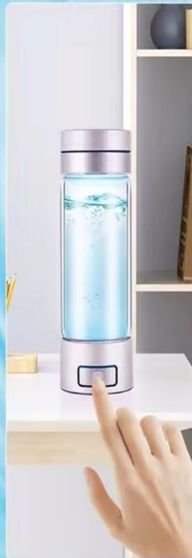
3M Rapid Electrolysis