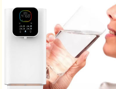
Drinking Hydrogen Water Hydrogen content: 4000ppb